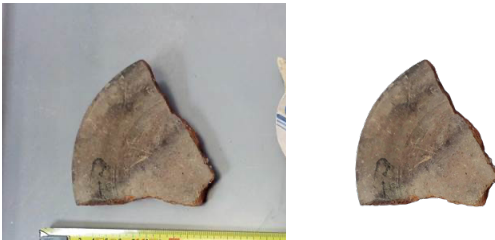
Fig. 1 - BiRefNet high-resolution segmentation of a video frame showing a ceramic fragment.

High resolution is particularly important in the context of cultural heritage. Many artefacts feature subtle details -small edges, decorative elements, or irregular contours- that must be recognised accurately. BiRefNet allows the system to preserve these fine details while maintaining computational efficiency, ensuring that the robot can operate in real time (fig. 1).